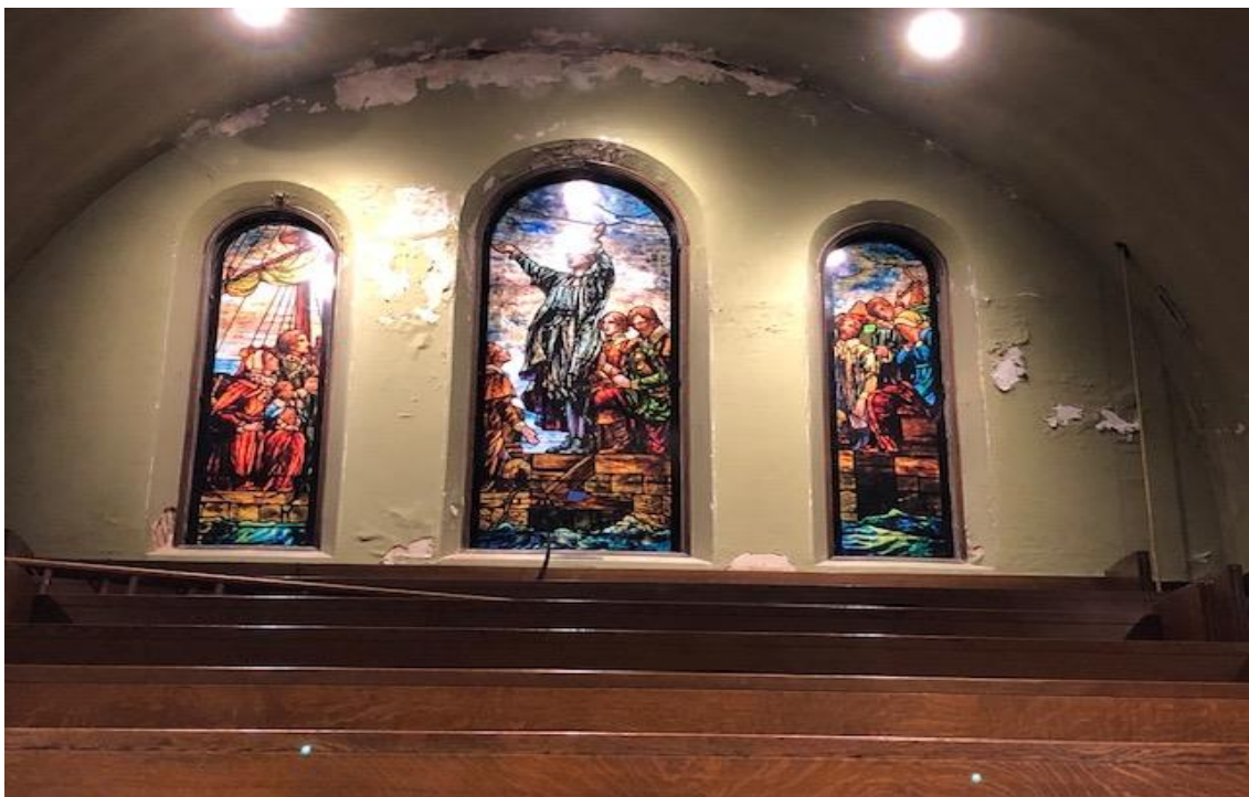
The Gallery Area of the Meetinghouse in need of restoration.